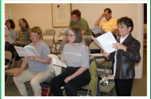
Rehearse on Thursdays nights with the Adult Choir.