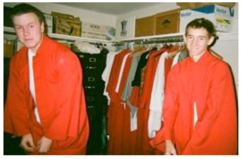
You too can wear the stylish robes!