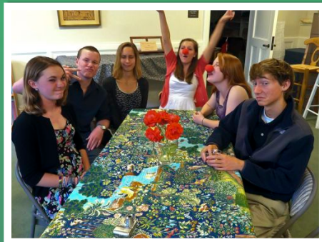
Or a Youth Choir party.