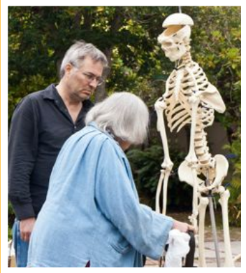
Does the skeleton count as this year's most unusual item for sale?