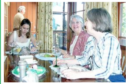
Enjoy Adult Choir brunch.