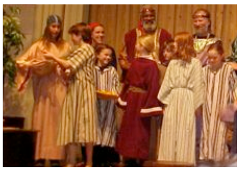
Or dress up for costume dramas!