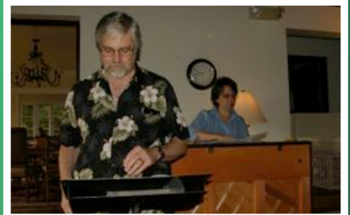
Or rehearse at Bishop's Ranch at the annual choir retreat.